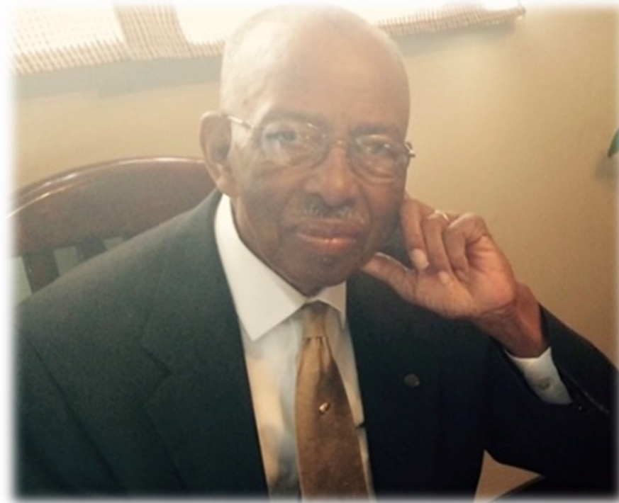
Psalm 23: 1-6