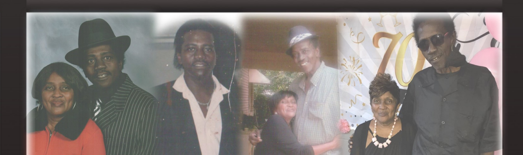
Eastview Cemetery Ashby Street ~ Americus, Georgia